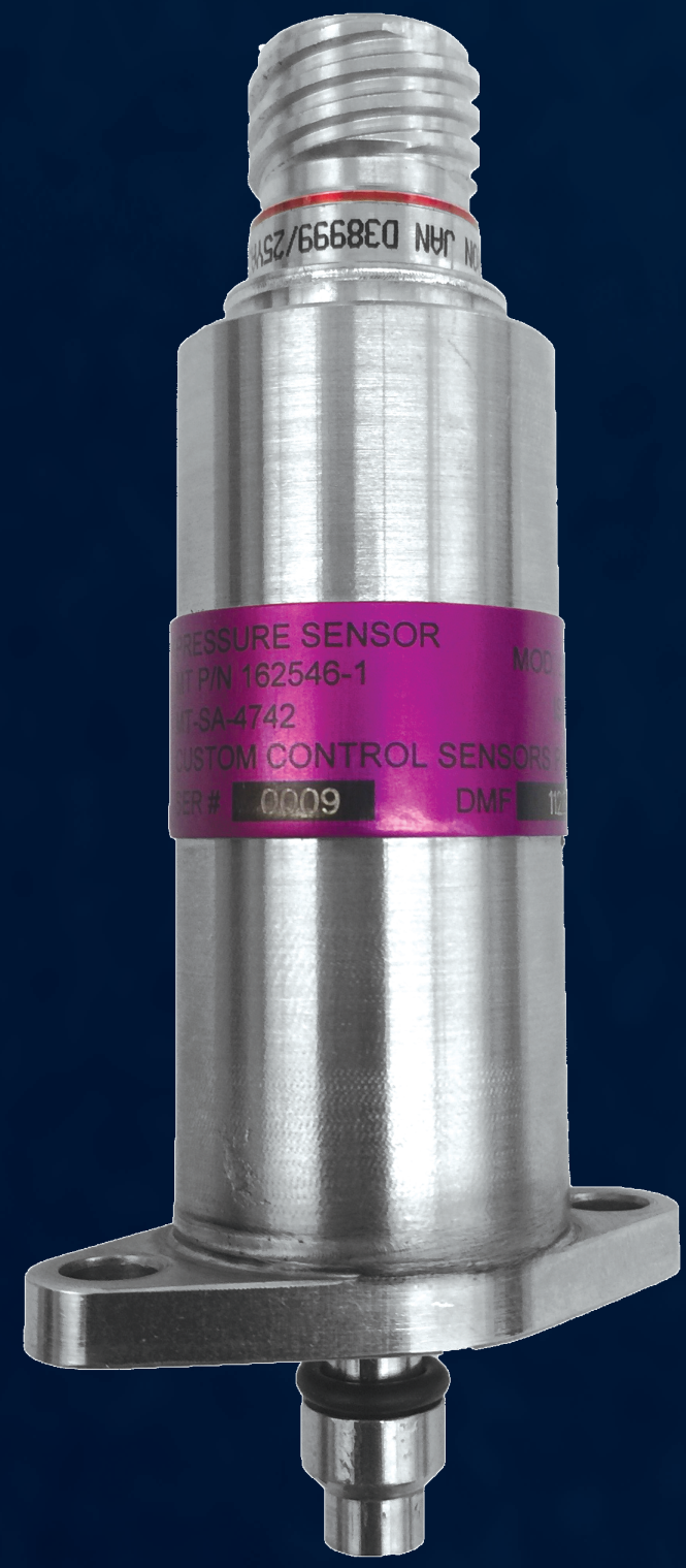
TRA - Absolute Pressure