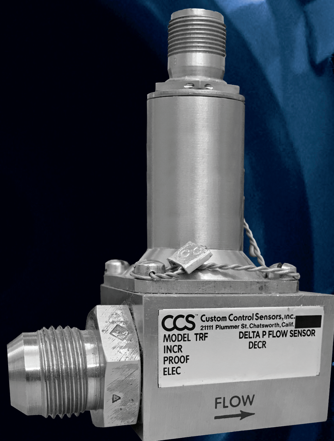
TRF - Delta P Flow