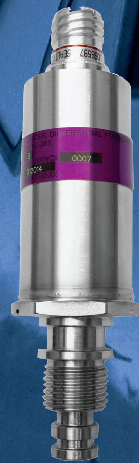
TRD - Differential Pressure