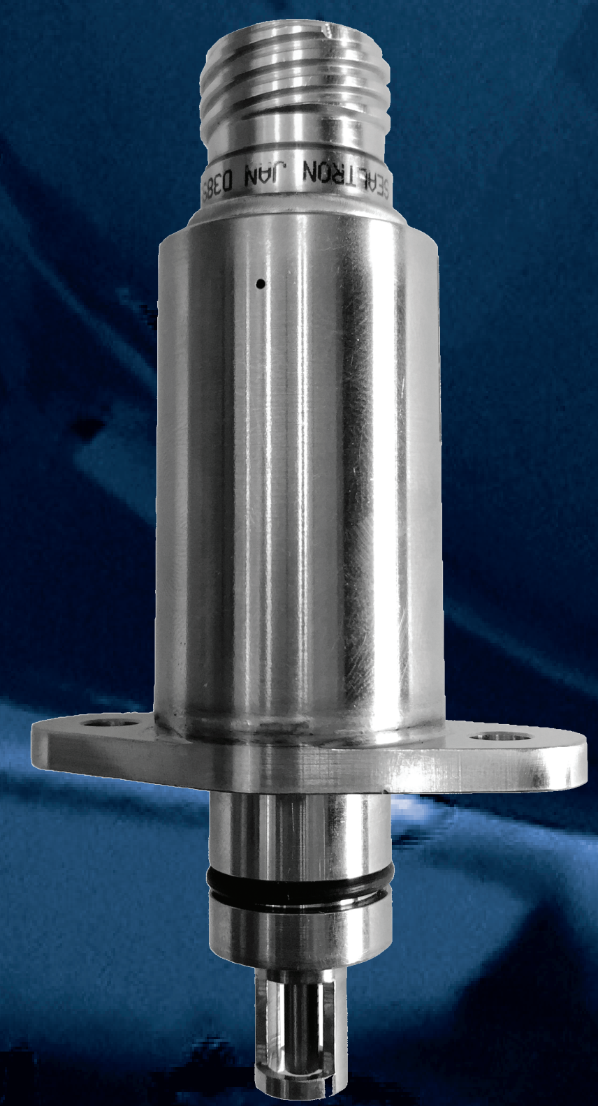
Multifunction - Pressure & Temperature

Solutions to Fluid Control, Monitoring and Measurement