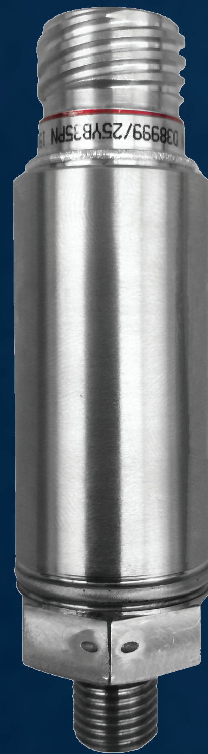
TRG - Gage Pressure